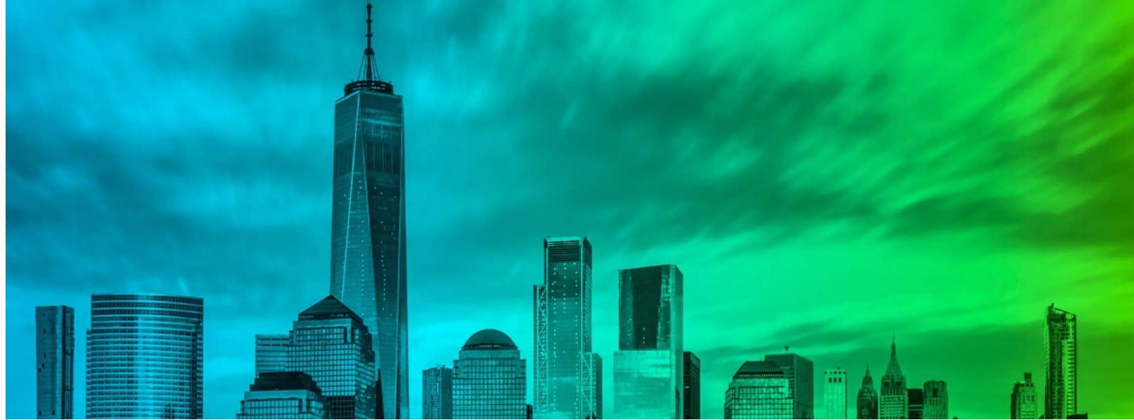
Figure1. New York City City-line | New York, NY USA [photograph].